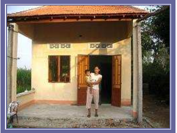
Two of the eight houses destroyed by the storm. We were able to rebuild all of them with your support