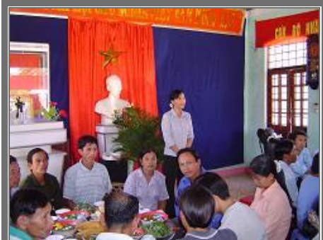
Women's Union thanked our staff