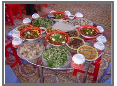
Delicious solar cooked dishes